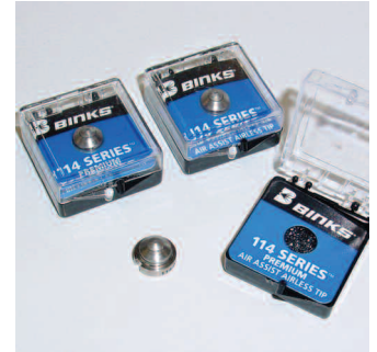
Premium range of tungsten carbide spray tips available.

The unique tip and air cap design of the Binks AA4000 Air Assisted Airless HVLP Spray Gun allows operators to use lower fluid and air pressure than competitors guns to achieve exceptionally fine finishes with superior paint savings and lower energy consumption.